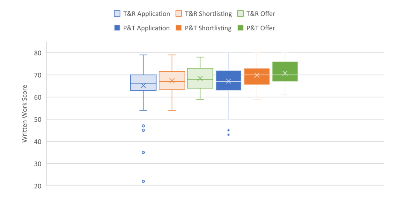
Graph 3: Distribution of Written Work scores of candidates at each principal stage of the admissions process in 2023-24.