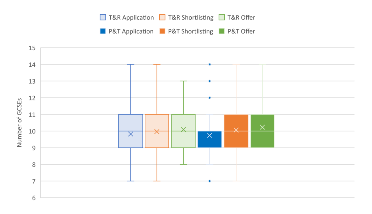
Graph 2: Distribution of the number of A*/9/8 grades at GCSE achieved by candidates at each principal stage of the admissions process.