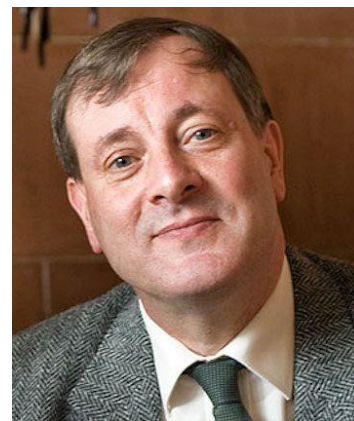
Professor Alister McGrath

If you have problems or questions, please do not hesitate to ask for help from those involved in graduate studies in Theology and Religion. The following pages will give you further details of those from whom appropriate advice may be sought.